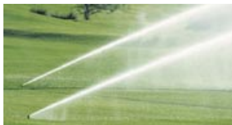
Distance Mode: Large radius coverage