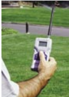
ICR Remote Control-Ready