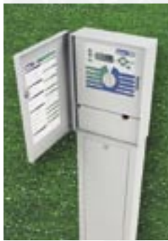
Stainless steel metal or plastic pedestal options.