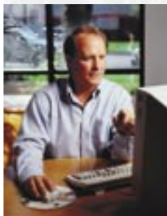
The ICC can be networked with the Hunter Irrigation Management and Monitoring System™ to make programming changes and monitor system conditions directly from your PC.